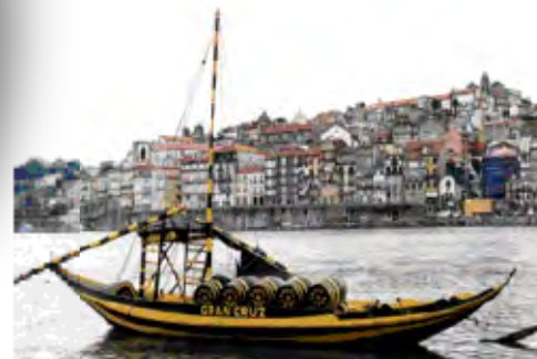
here comes our wine!!

Whine Divas August 15, 2011 1618 Wine Lounge 1727 Battleground Greensboro