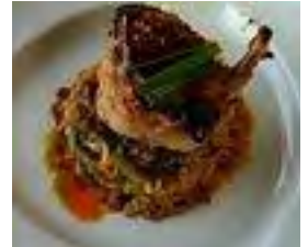
Five Spice Honey Chicken

Attached (page 4) for your review is a summary of our ratings of some of the restaurants we've visited in the past few years. Be part of this process and join us on the last Wednesday of every month. Our schedule for 2010 is on the WPF website, so plan ahead! WPF