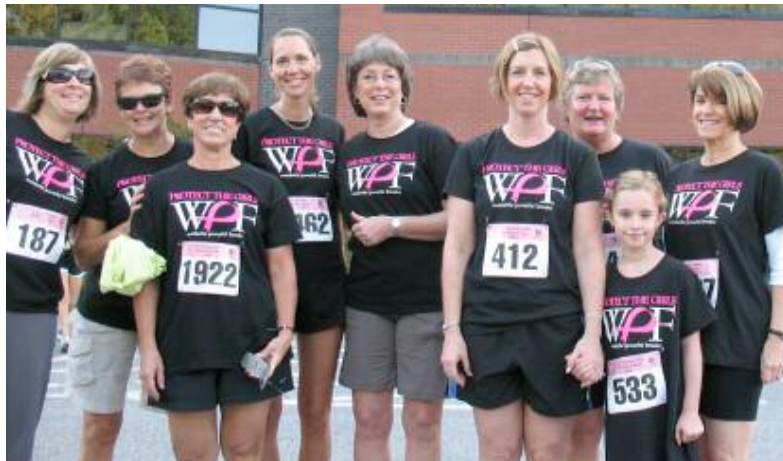
Some of the more than twenty WPFers that walked or ran in the Women's Only Walk and Run on October 3.

To summarize the highlights, it is estimated that there were 4,000 attendees overall, which includes a record 2,811 participants on the race course, over 300 volunteers, 30 exhibitor groups, 36 business sponsor organizations and the most ever on-site guests of family & friends than we have ever witnessed in the history of this event. This includes 1,000+ people from outside of GSO, throughout NC who journey here. Pictured here are some of the more than twenty WPFers that walked or ran in the Women's Only.